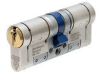
X60 – Euro Cylinder