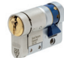
X60 – Half Euro Cylinder