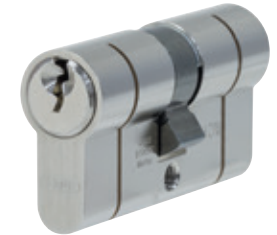
E50PS – Euro Cylinder