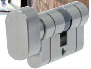
E50PS – Euro Thumbturn Cylinder