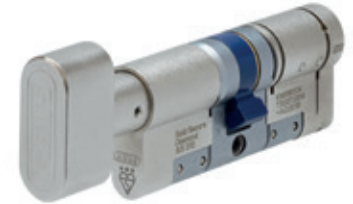
X60 – Euro Thumbturn Cylinder