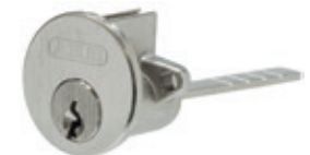
E50PS – UK Rim Cylinder