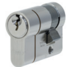
E50PS – Half Euro Cylinder