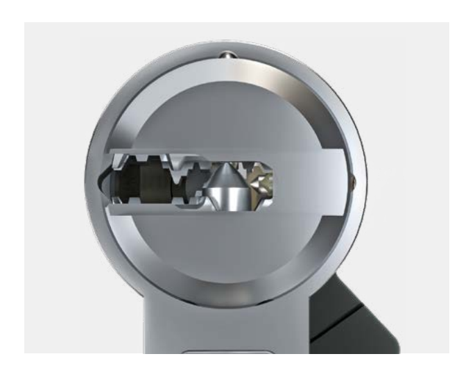
The modern reversible key system with horizontal key insertion is convenient and comfortable to use. The high-quality precision profile ensures easy insertion.