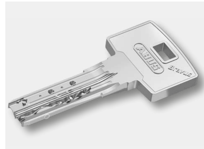
The innovative shape of the key makes it almost unnoticeable in a trouser pocket. The modern, solid key does not snap. It is made from a low-wear material to ensure long-term security.