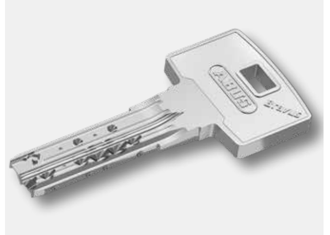
The innovative shape of the key makes it almost unnoticeable in a pocket. The modern, solid key does not snap. It is made from a high-quality material to ensure long-term security.