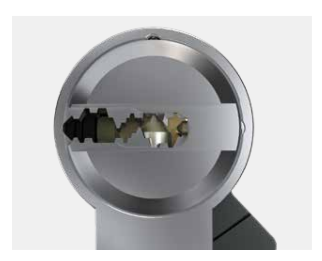
The modern reversible key system with horizontal key insertion is convenient and comfortable to use. The high-quality precision profile ensures easy insertion.