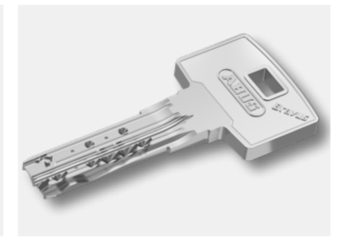
The innovative shape of the key with its wave coding makes it almost unnoticeable in a pocket. The modern, solid key does not snap. It is made from a high-quality material to ensure long-term security.