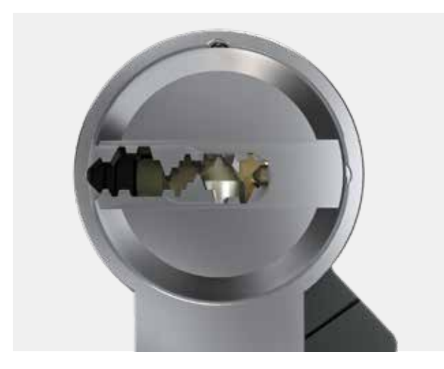
The modern reversible key system with horizontal key insertion is convenient and comfortable to use. The high-quality precision profile ensures easy insertion.