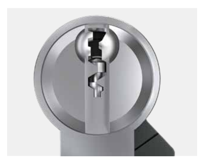
The Zolit conventional locking system with vertical key insertion opens the door conveniently.