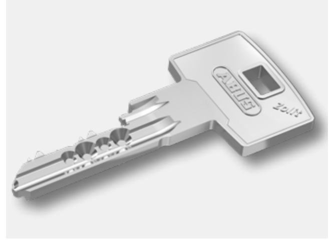
The high-quality, stable key is made from low-wear nickel silver to ensure long-term security.